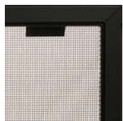
Safety Screen Barrier