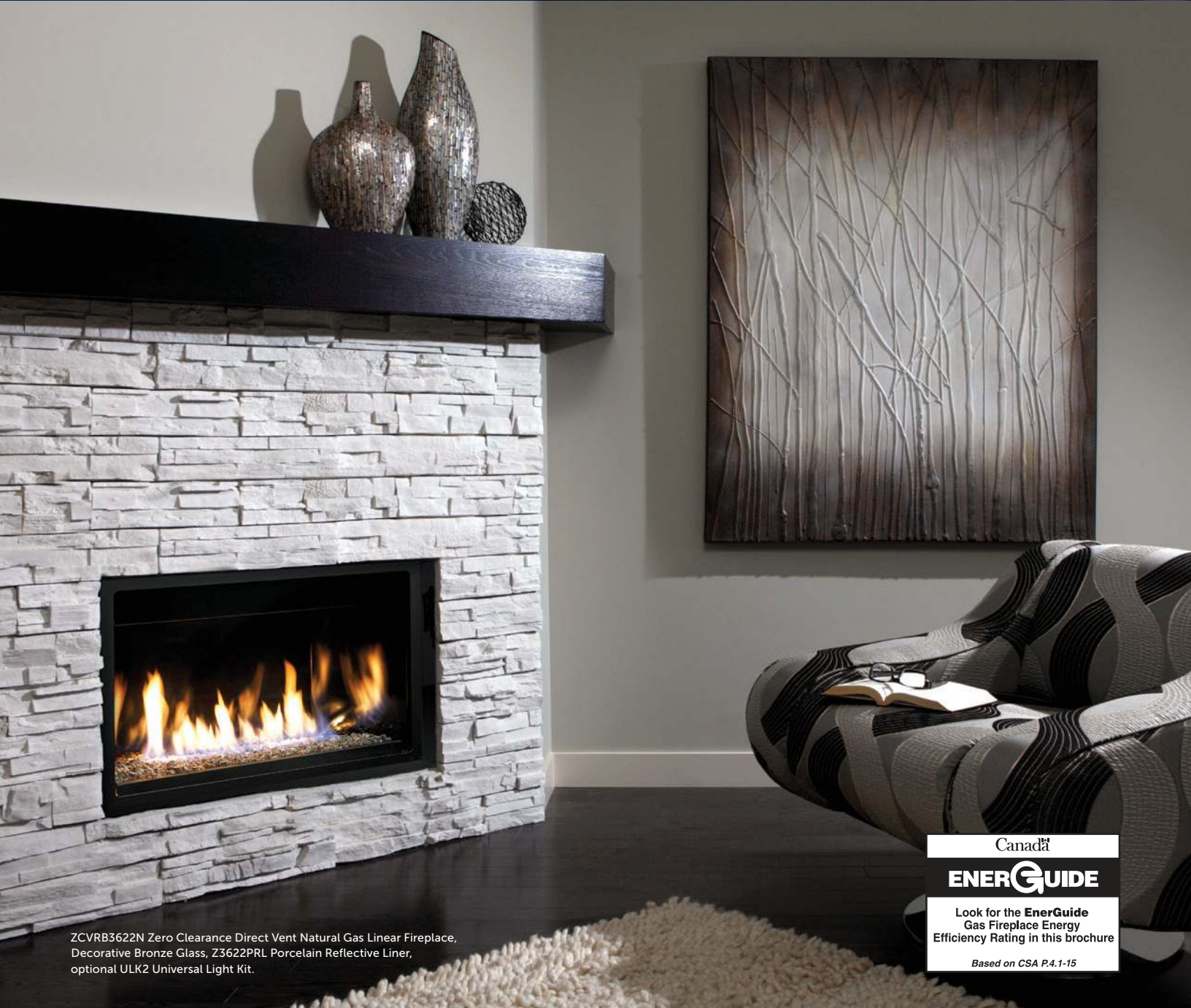
ZCVRB3622N Zero Clearance Direct Vent Natural Gas Linear Fireplace, Decorative Bronze Glass, Z3622PRL Porcelain Reflective Liner, optional ULK2 Universal Light Kit.

ZERO CLEARANCE DIRECT VENT LINEAR GAS FIREPLACE