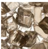
Decorative Ember Glass - Bronze