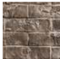
Traditional Brick Liner