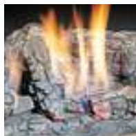
Fibre Oak Log Set